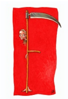
export/sites/universitat-ileida/ca/serve